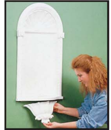
Or Applies to model N300 ONLY.